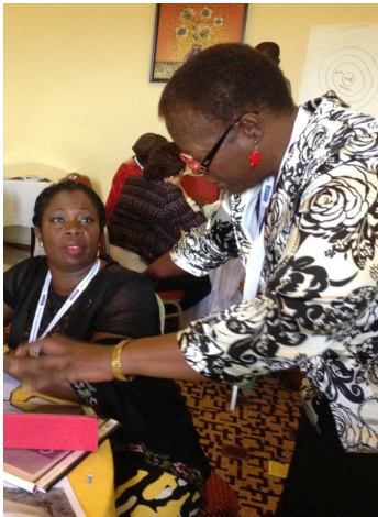
CNC fosters common understanding and shared goals related to achieving CAADP.